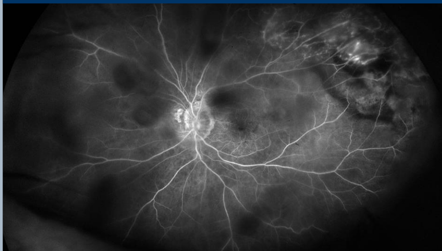
Figure 1: Late Phase IVFA OS w/ superotemporal media opacity consistent w/ vitreous debris, large heterogeneous lesion w/ coalescent areas of blockage, surrounding hyperfluorescent punctate staining consistent w/ microaneurysms, and diffuse capillary nonperfusion with late leakage.